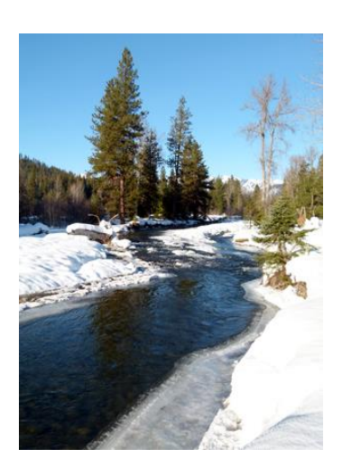
Teanaway Community Forest Webpage

The Washington State Department of Natural Resources (DNR) has published its 2014 Annual Report which shared that leasing and natural resource sales on state trust lands produced nearly $265 million in non-tax revenue for public school construction, county services, state universities, and other beneficiaries. The amount included more than $120 million for common school construction, $75 million for services in Washington counties, $14